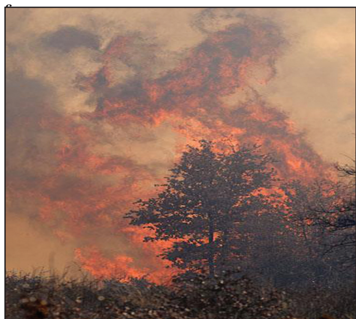
Trees burned rapidly during one of several fires experienced by fire fighters last week.