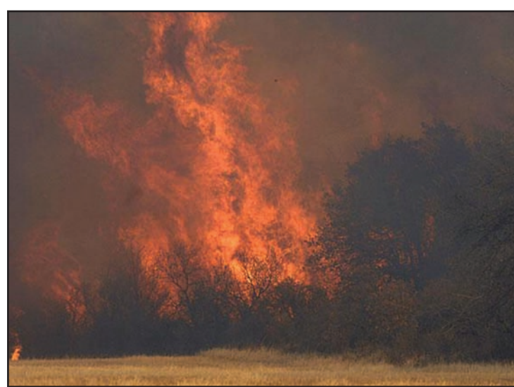
Fire spread across much of the Big Country last week.