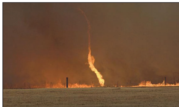
A fire tornado forms in Hawley during one grass