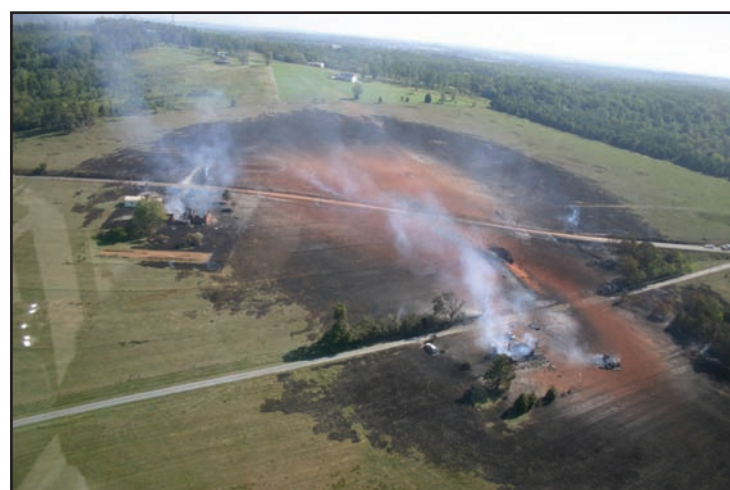
Someone hit a gas line and blew up a house and burned the surrounding area.